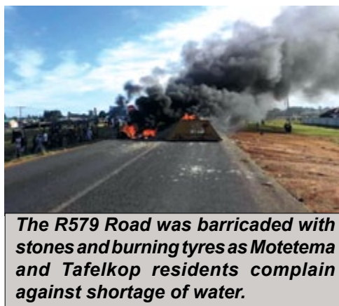
The R579 Road was barricaded with stones and burning tyres as Motetema and Tafelkop residents complain against shortage of water.