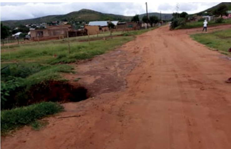
The fatal D4280 Road that links Mokwete and Molepane Villages in Makhuduthamaga Local Municipality.